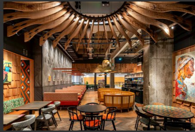
NANDOS - GLASGOW