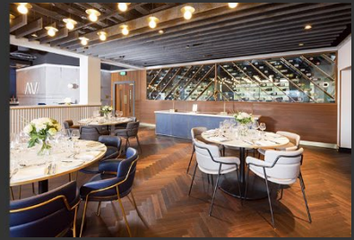
ASTON VILLA FOOTBALL CLUB

With more than 22 years' experience, Hill Cross Furniture are the leading supplier of Contract Furniture and Banquette Seating to the Hospitality, Healthcare, Leisure and workplace sectors. We are well known for the extensive range of quality furniture we supply, as well as for our project management and installation service. This is only possible with great clients and our fantastic team. Look at some of the great brands we work with... have a peek at our amazing projects in our portfolio.